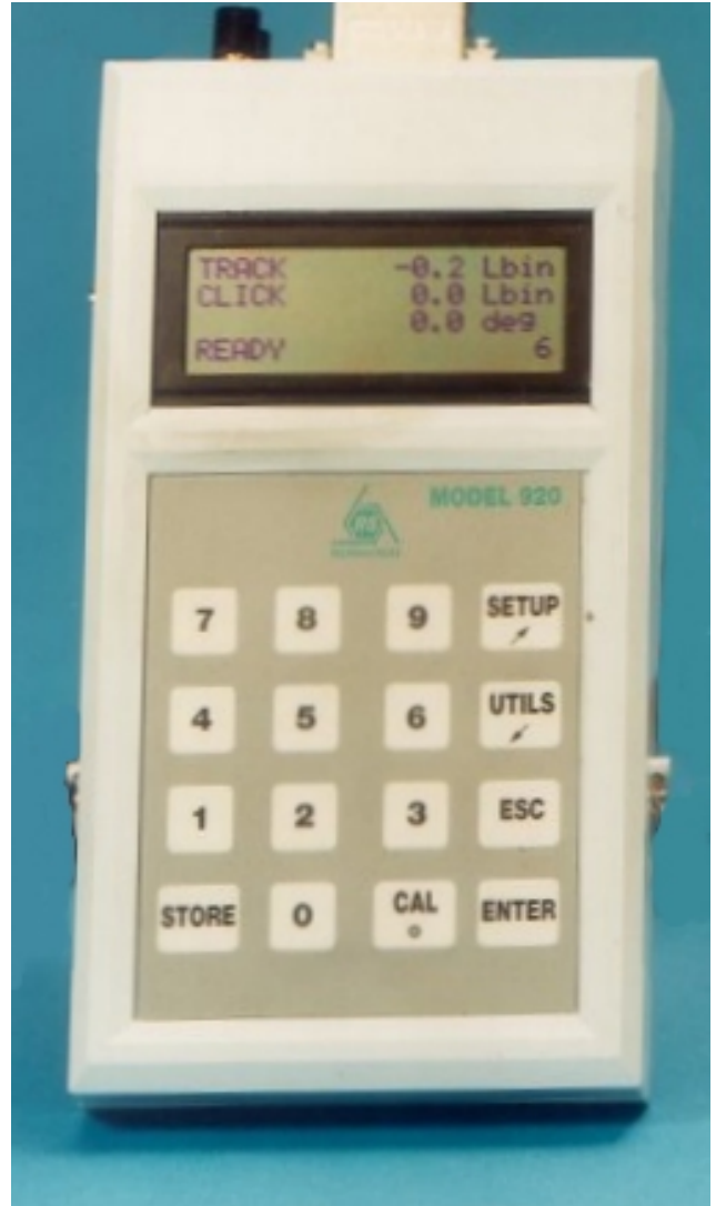
Figure I. Model 920 Front Panel, showing keypad and main screen

If you have any questions about this unit, its setup and operation do not hesitate to contact your RS Technologies distributor, representative, or the factory for technical support.